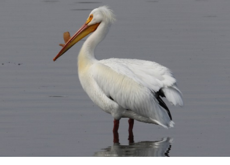
American white pelican