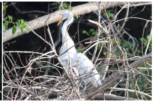
Little heron Little egret Plumed egret