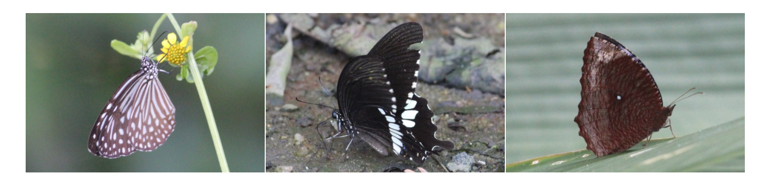
Blue glassy tiger Common Mormon (male)