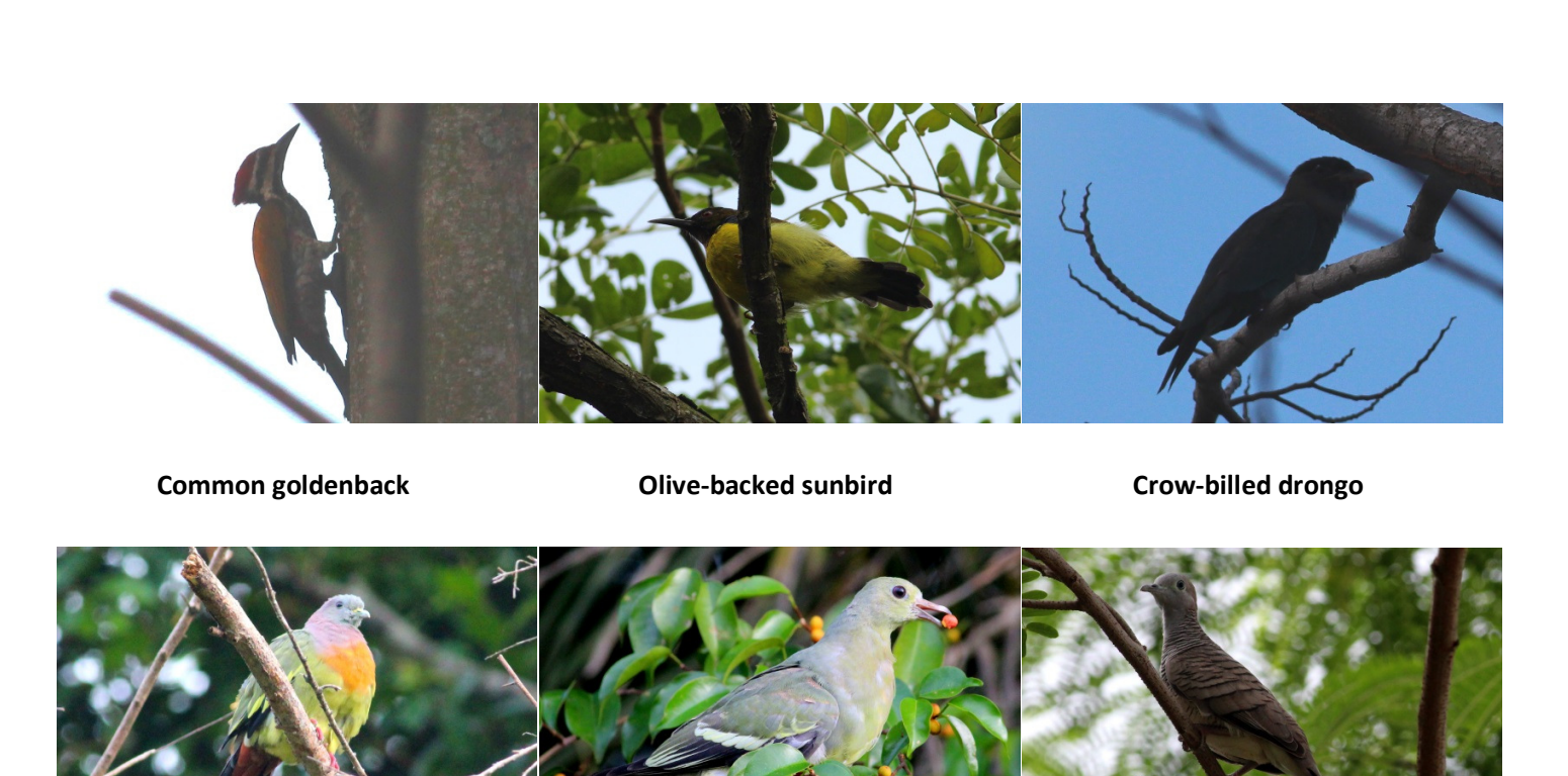
Pink-necked pigeon (male)