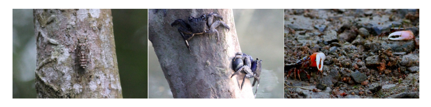
Cicada Tree-climbing crab Signaling crab