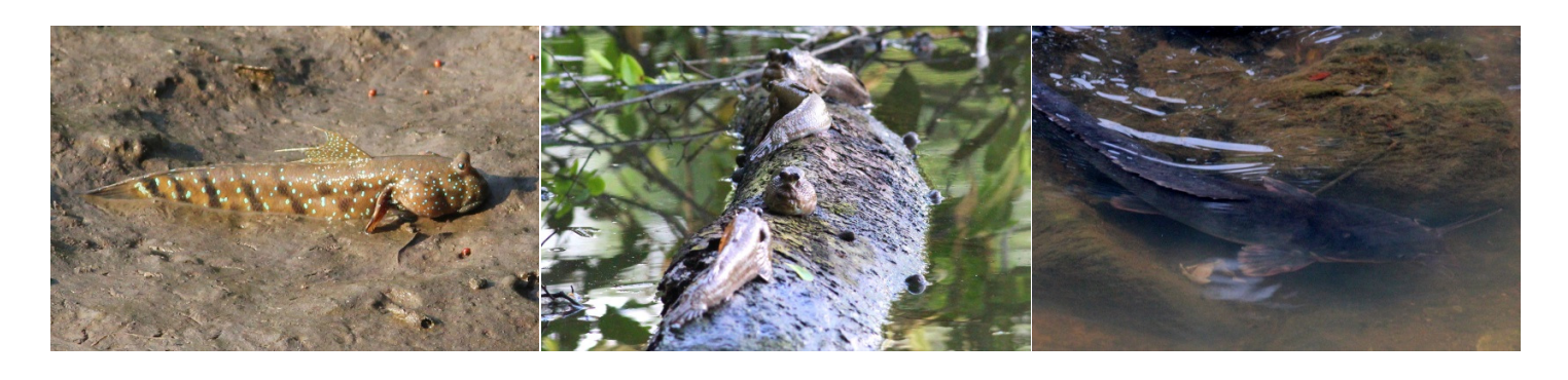
Mud skipper Mud skipper Cat fish