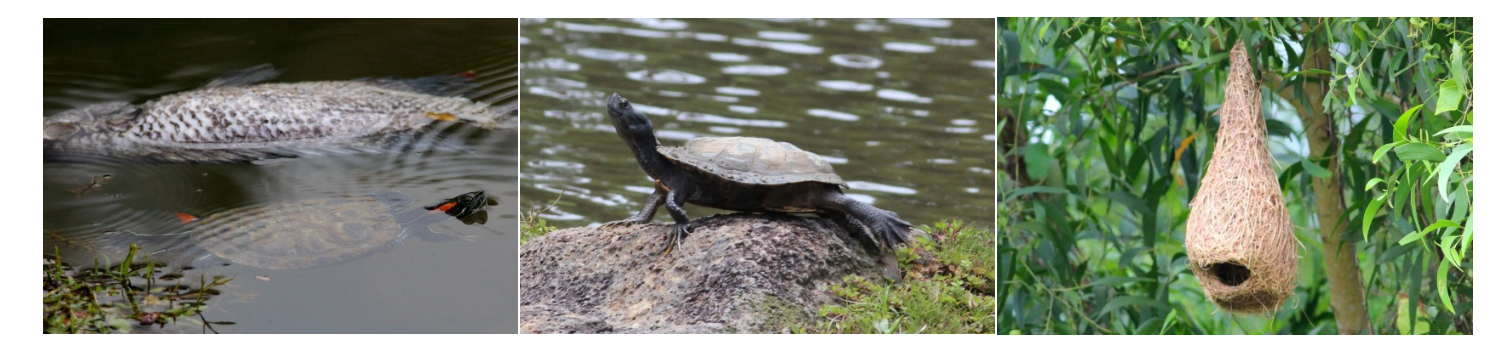
Red-eared slider (feeding)