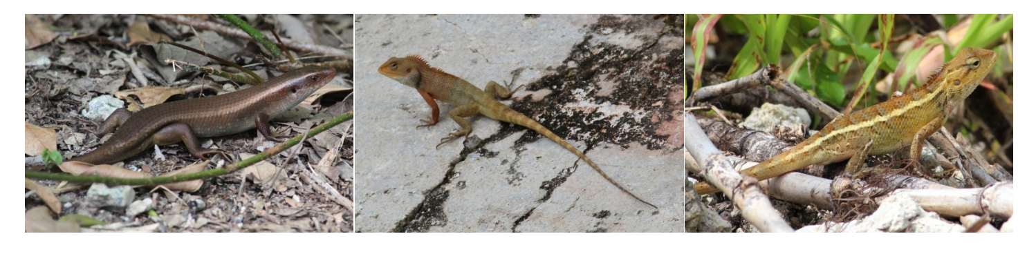
Common sun skink