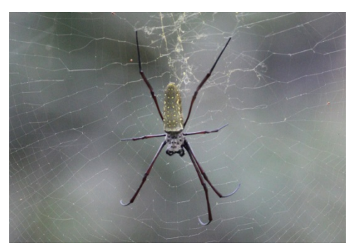
Mud skipper Archerfish Giant orb spider