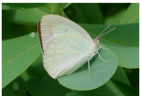
Brown pansy Leopard Mottled emigrant