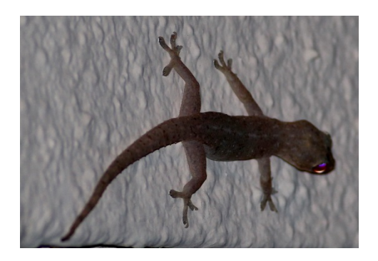
Asian house gecko