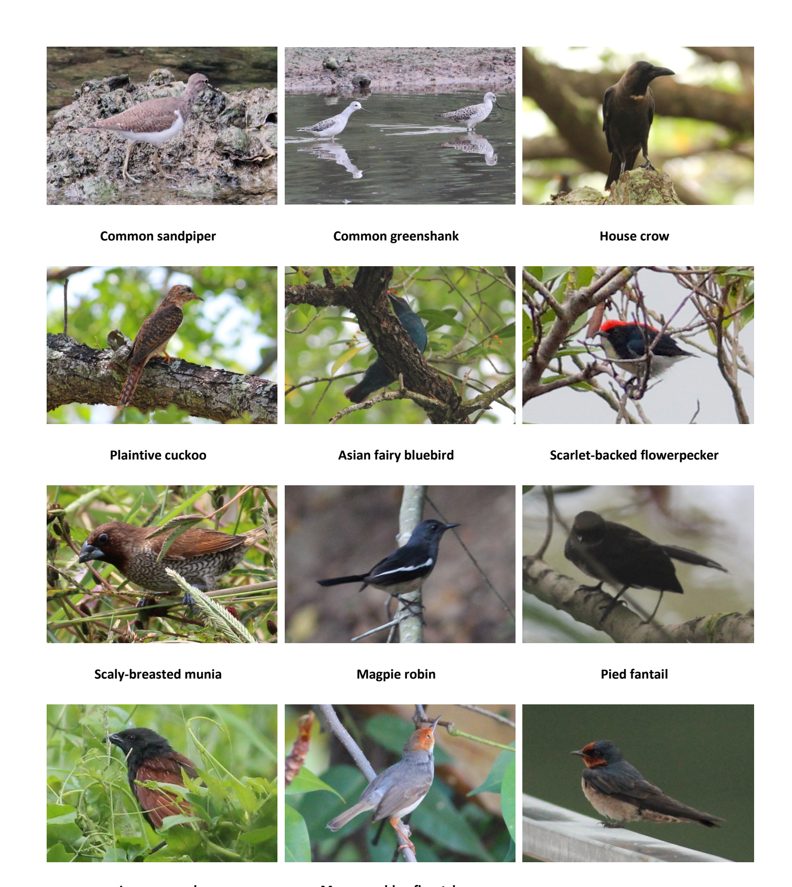
Lesser coucal Mangrove blue flycatcher Pacific swallow